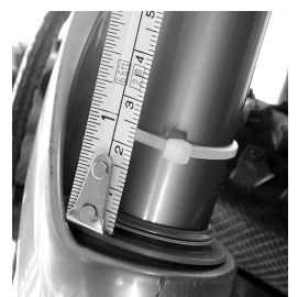
Fig. 4 Measure SAG