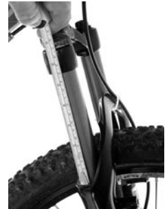
Fig. 1 Checking Travel