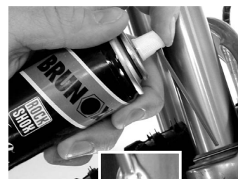
Fig. 6 Keep it Clean & Smooth

This fork relies on oil bath lubrication between the upper tubes and the lower tube bushings to keep them running smoothly. After use, the oil tends to gather at the bottom of the fork and the fork may become sticky. Periodically try storing your bike upside down or from a wall hook ( Note: Check your disc brake manufacturer's owner's manual to ensure that damage is not caused by placing your bike upside down for prolonged periods ). In this way the RedRum lubricant can run back down between the bushings, to provide many more hours of smooth operation.