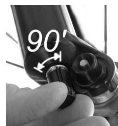
Fig. 5 Adjusting Rebound