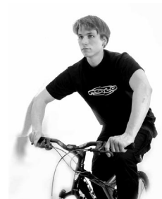
Fig. 3 Checking SAG