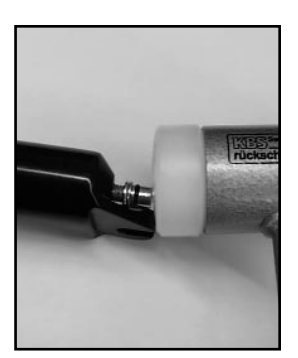
Fig. 3 Fig. 4 Fig. 5