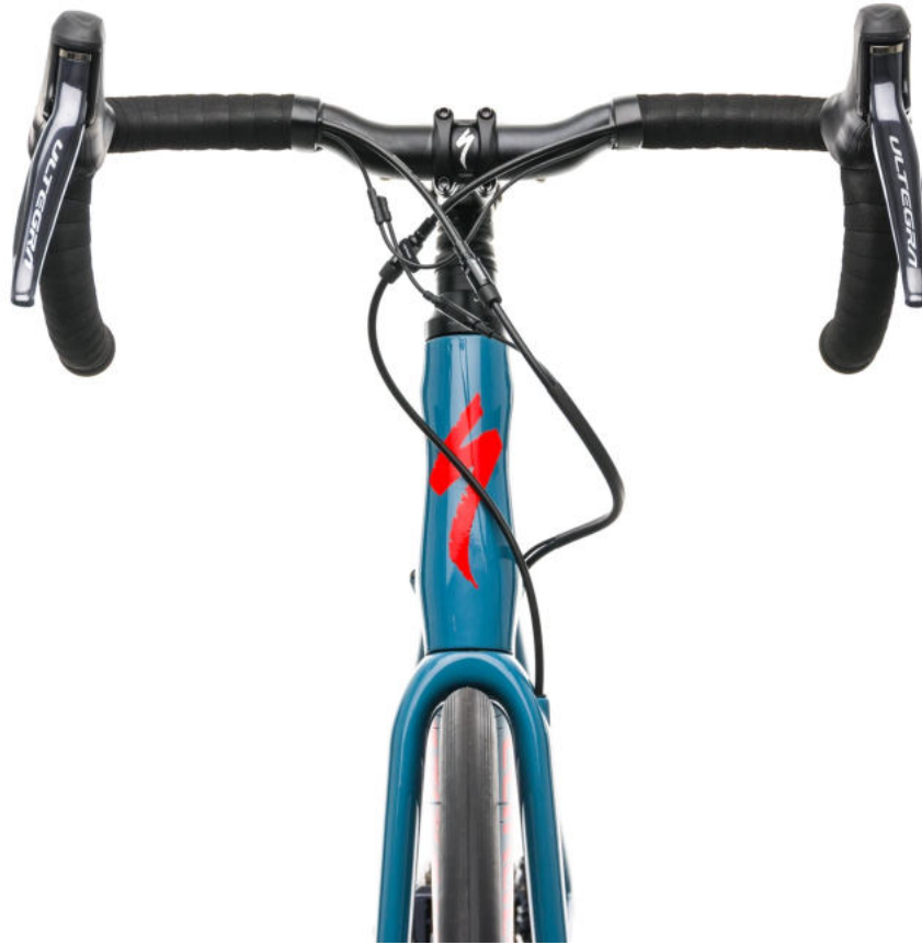
A future Shock headset from the front

The introduction of Future Shock on the 2017 Roubaix was a large departure from the simplicity of Zertz inserts, which are passive damping inserts with no moving parts. Specialized partnered with Formula 1 innovators, McLaren Applied Technologies, to design the new Future Shock. It uses a spring in the head tube that actively suspends the rider with 20mm of vertical travel.