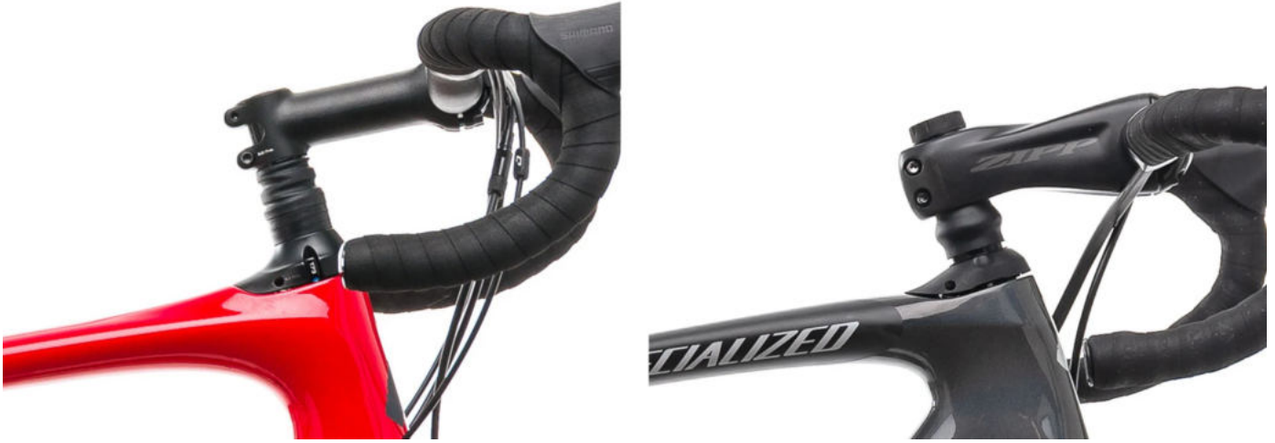
Future Shock 1.0 vs Future Shock 2.0. Note the damping adjustment dial and the new boot.

The 2020 Roubaix introduced Future Shock 2.0 on the high-end of S-Works, Pro, and Expert builds. This adds a hydraulic damper to the system to further improve the suspension characteristics. It still utilizes a small coil spring, but the hydraulic damper improves compression and rebound damping, and it gives the rider an external dial to adjust damping on-the-fly. Turning the dial clockwise closes damping. This makes the Future Shock feel stiffer for sprinting (it does not fully lock-out). Turning it counter-clockwise opens damping to make it feel softer and more active on rough surfaces. There is also a more discrete looking shock boot under the stem.